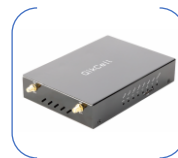
4G ATA Router

All specifications are subject to change without notice | v004